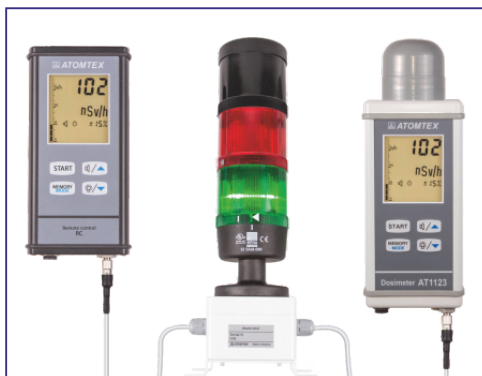
Dosimeter with external control and external alarm units

External control unit and external alarm unit can be attached to dosimeters for remote monitoring application.